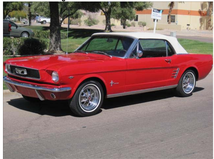
Last Updated more than 20 days ago